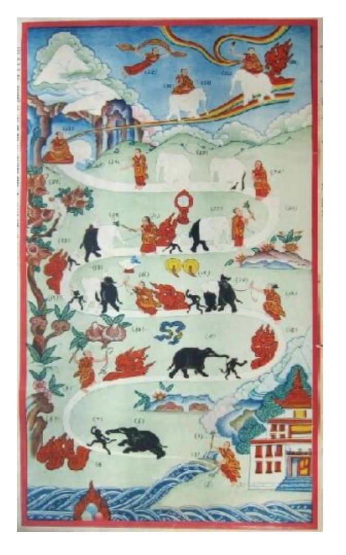
B. Alan Wallace. The Attention Revolution (2006)